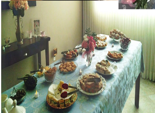
May 14 Scholarship Tea Honoring the new Chaffey College 2022 recipients. A lovely assortment of tea sandwiches, sweet bites, delicious tea and chance to hear great stories were enjoyed by all.